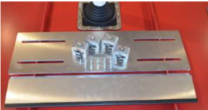
Above photo shows the components included with the SS VentSaver Plate.